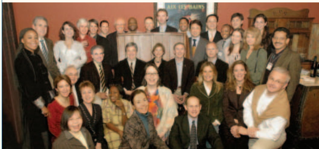
Participants at the January 2006 session of the Advanced Health Leadership Forum.