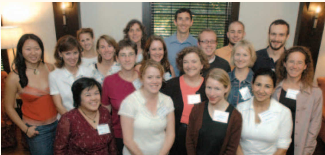
2005–2006 School of Public Health scholarship recipients gathered at the Women's Faculty Club to meet their sponsors at the annual Scholarship Tea.