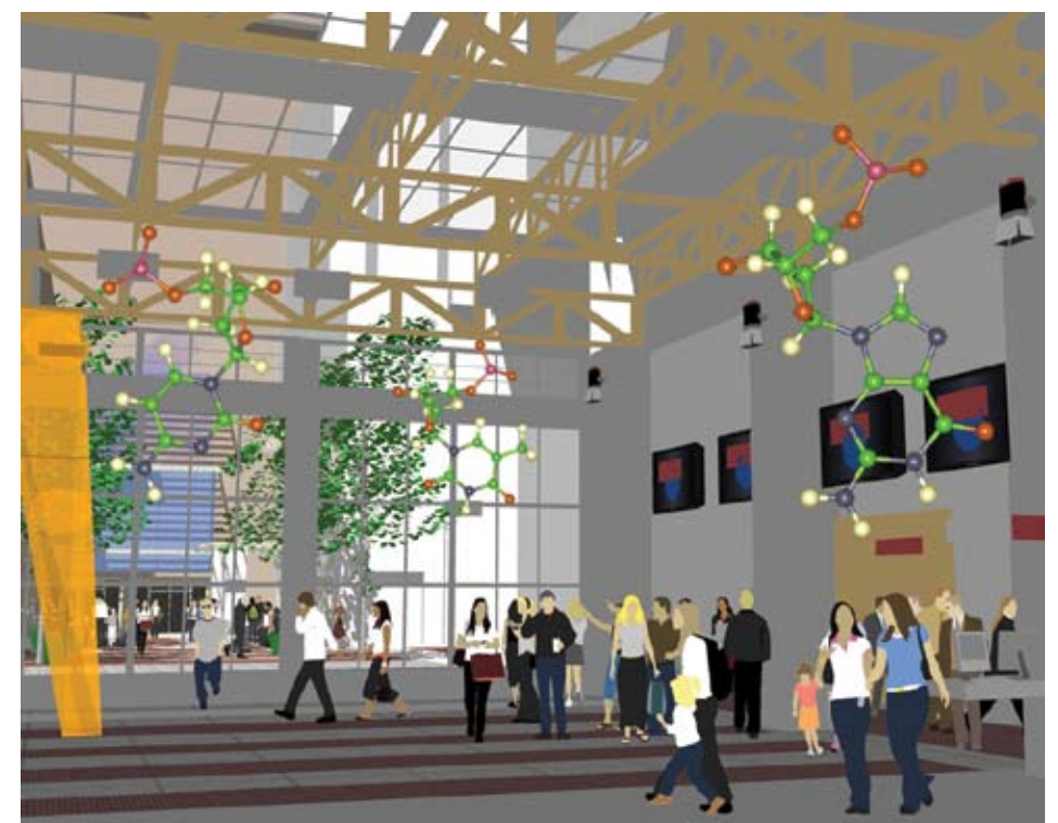
Community Health Campus artist's concept