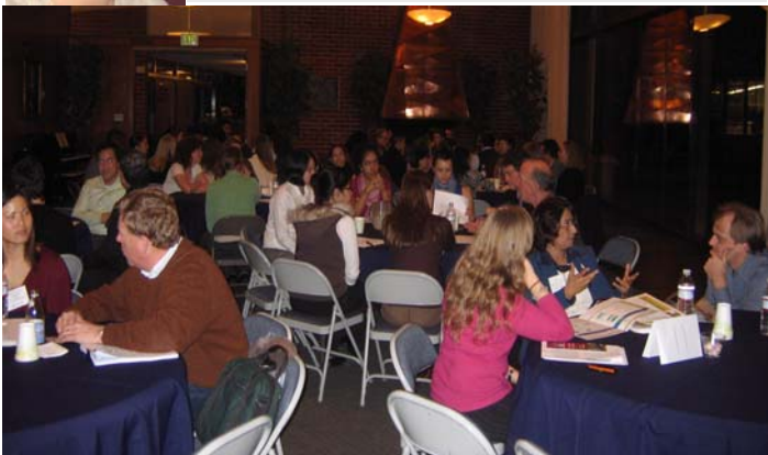
Left: Students and representatives from various organizations at roundtable discussions.