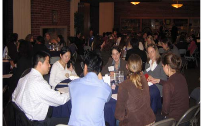
Right: Students at roundtable discussions with representatives of public health organizations.